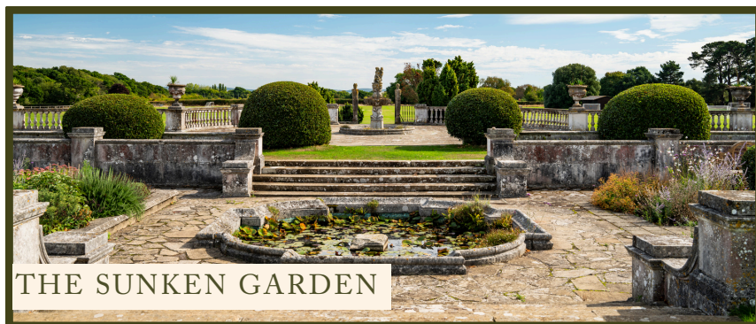
THE SUNKEN GARDEN