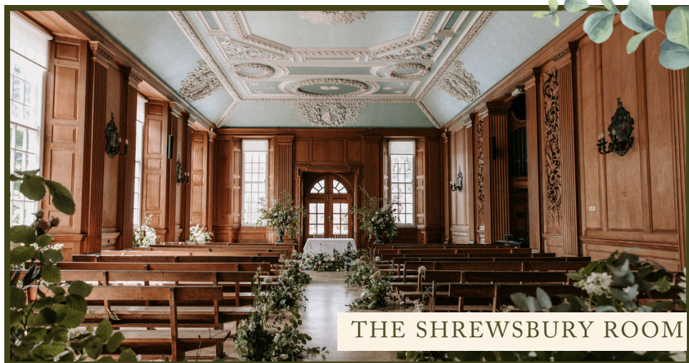
THE SHREWSBURY ROOM