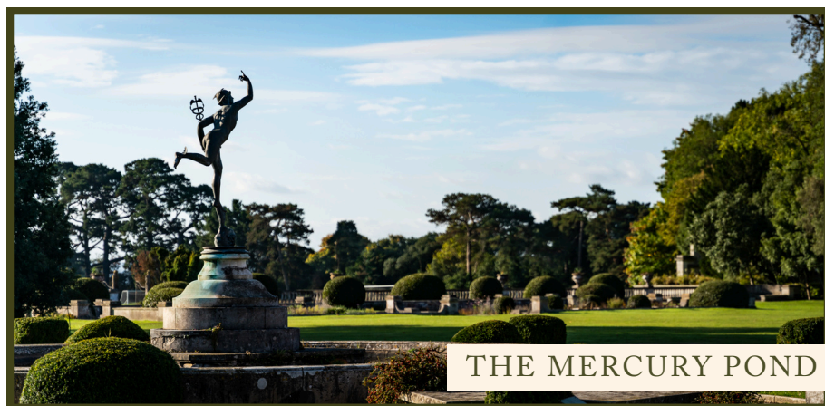
THE MERCURY POND